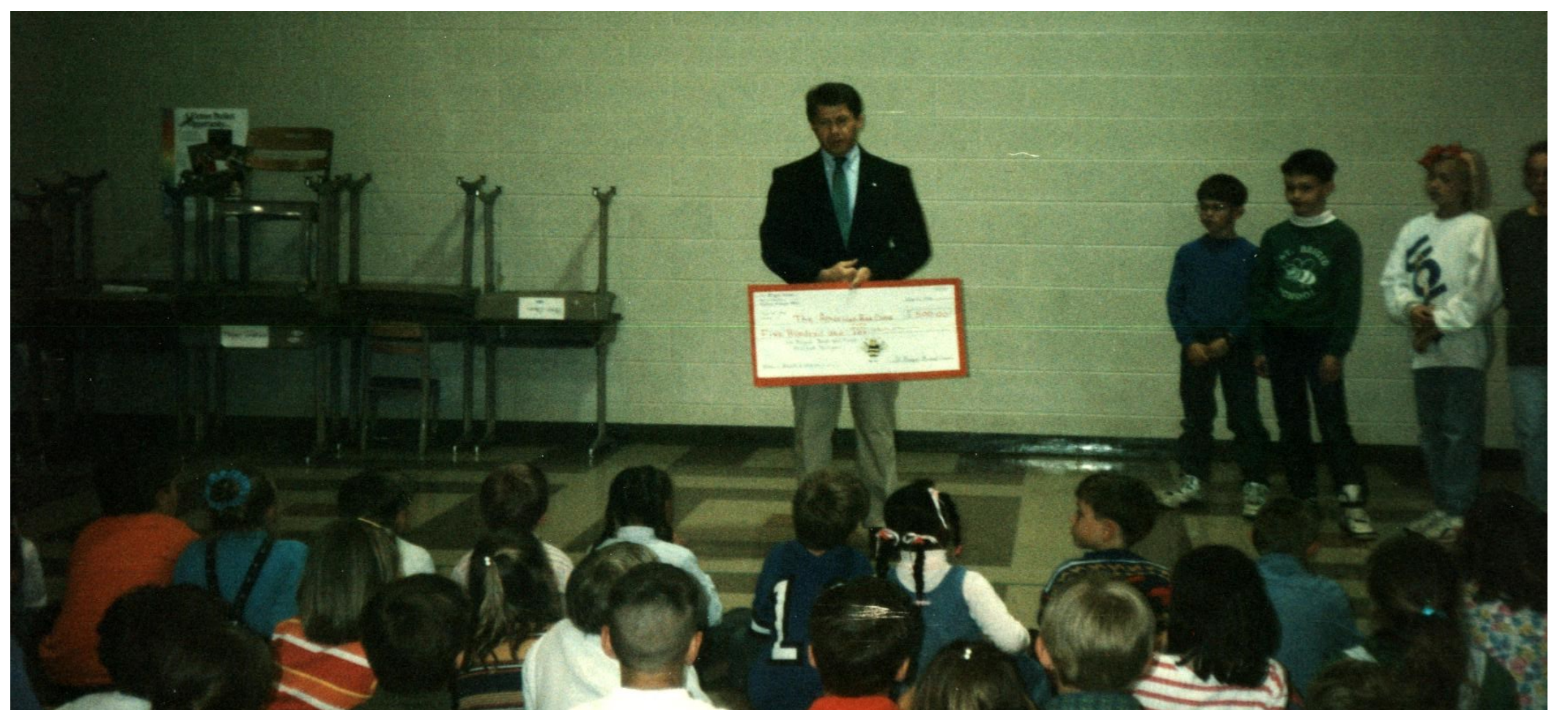
Continuing a tradition of service, Saint Brigid student council raised $500 for the American Red Cross.