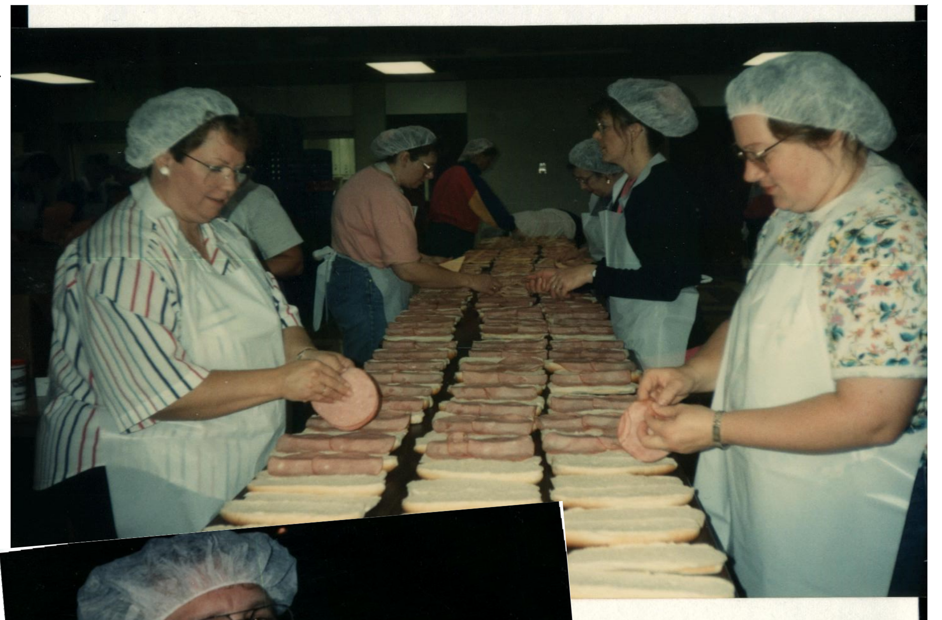
Making and selling subs was an annual fundraiser!