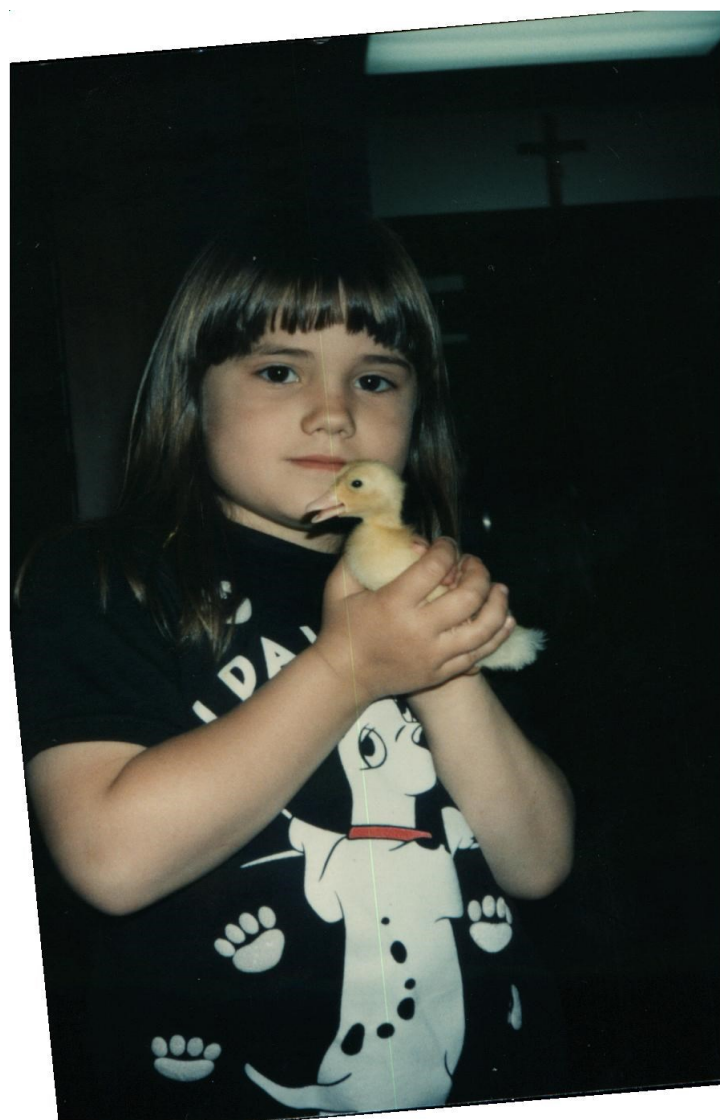
Kindergarten students raised ducks!