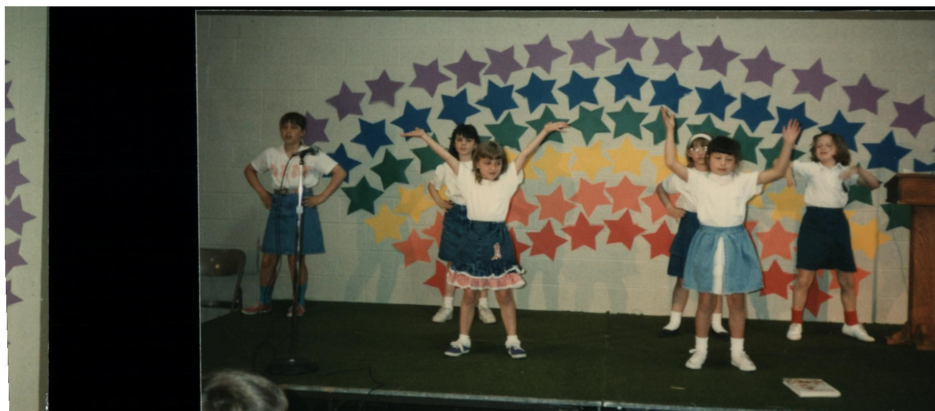
Saint Brigid students have talent! The annual talent show begins in the 90's.