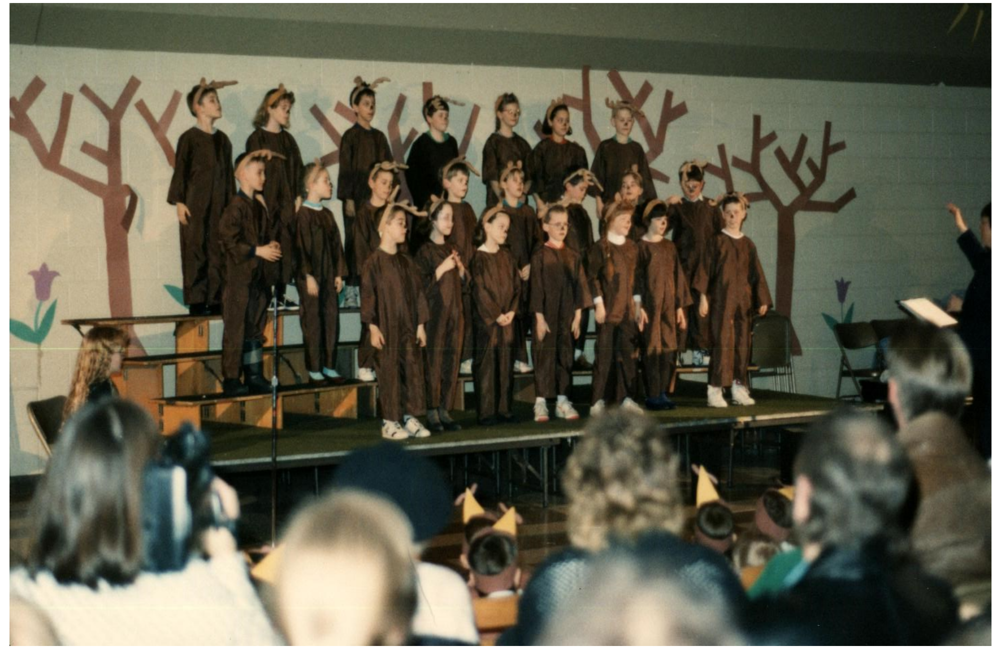
Christmas Concert in the cafeteria (now the open area).