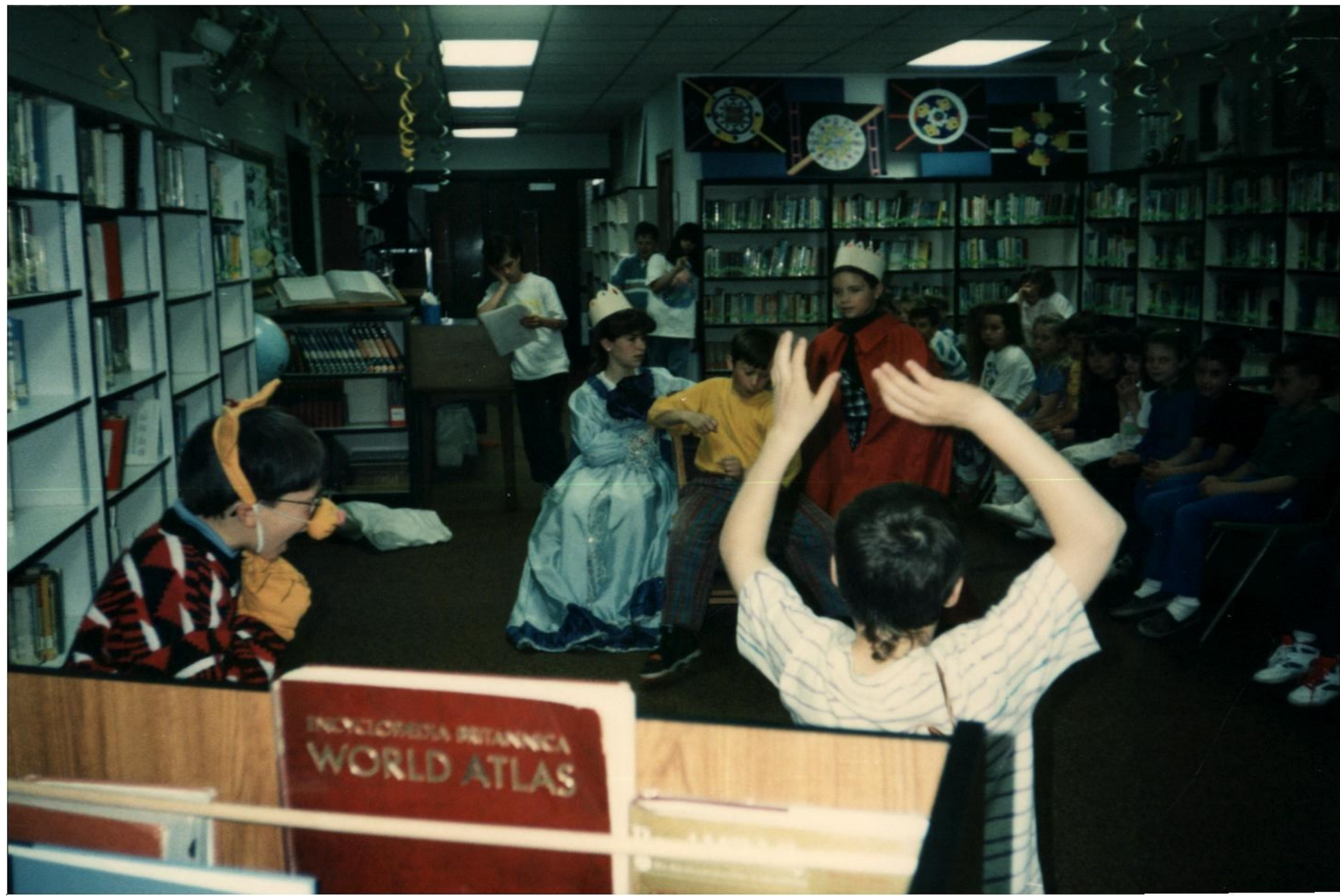
Students re-enact a story in the library. The library in the 1990's is now our locker area downstairs.