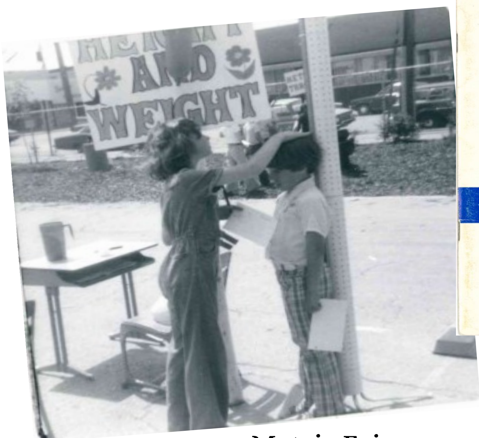
Metric Fair 1977