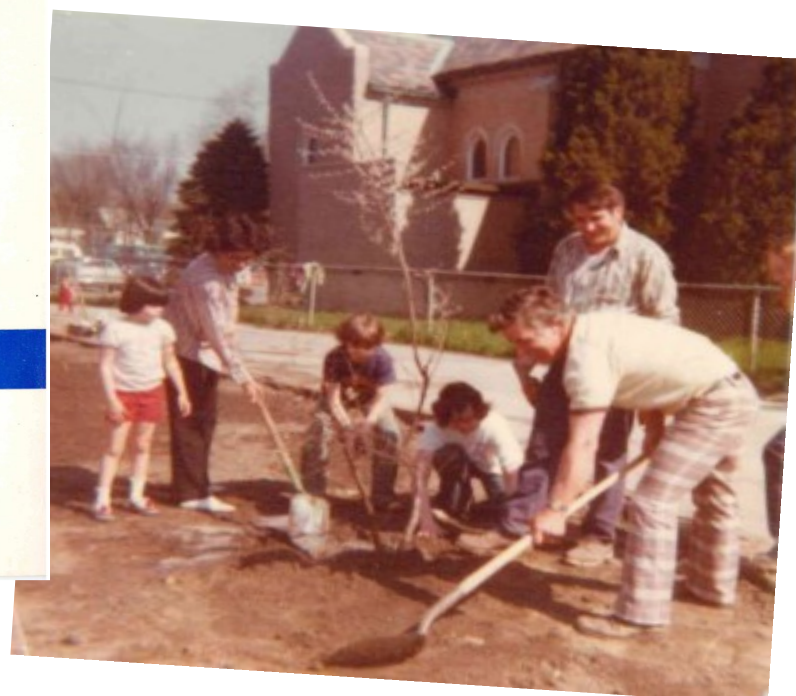
Beautification Day 1975