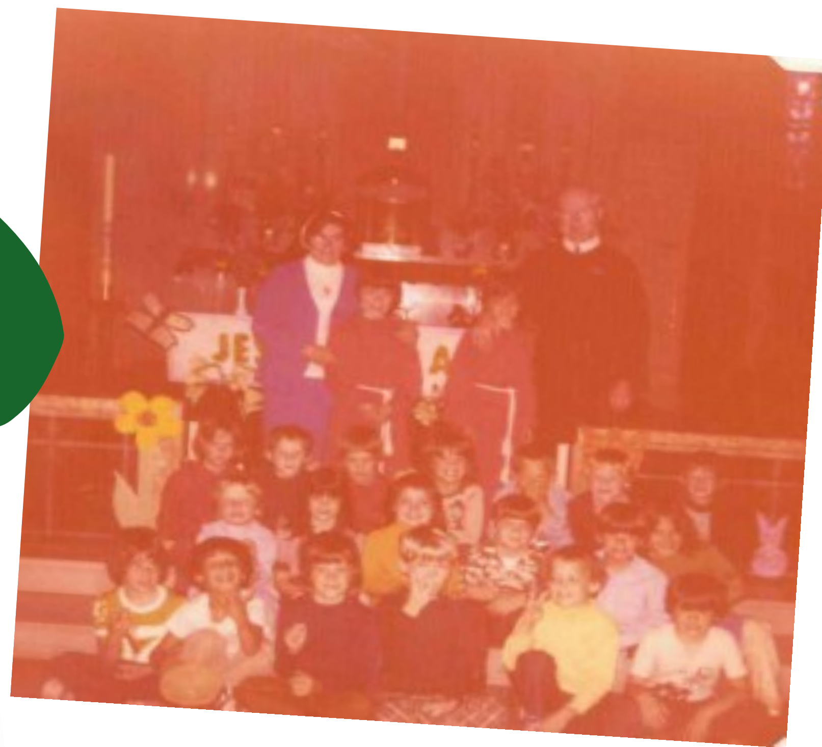
May Crowning 1977

TUITION: $90 PER FAMILY BOOK FEES: $15 PER CHILD UP TO 4 CHILDREN. MAXIMUM BOOK FEE PER FAMILY, $60.00 TERMS: $25 TUITION DUE SPRING PRE-REGISTRATION* $20 TUITION DUE SEPTEMBER SCHOOL OPENING $45 BALANCE TUITION DUE BY LAST DAY OF FIRST SEMESTER (END OF JANUARY) $15 BOOK FEE PER CHILD DUE SEPTEMBER SCHOOL OPENING. EXTENDED TERMS MAY BE ARRANGED IF NECESSARY FOR BOOK FEES FOR FAMILIES WITH MORE THAN 1 CHILD. * FOR 1971-1972 THE BALANCE OF THE SPRING FEE NOT PAID AT PRE-REGISTRATION IS DUE BY JUNE 1, 1971