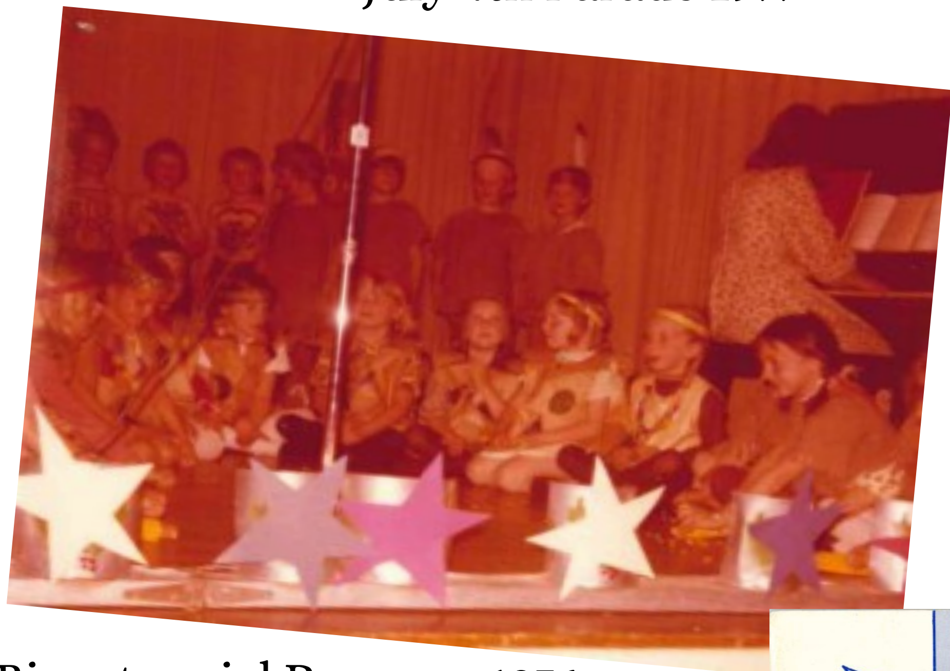
Bicentennial Program 1976