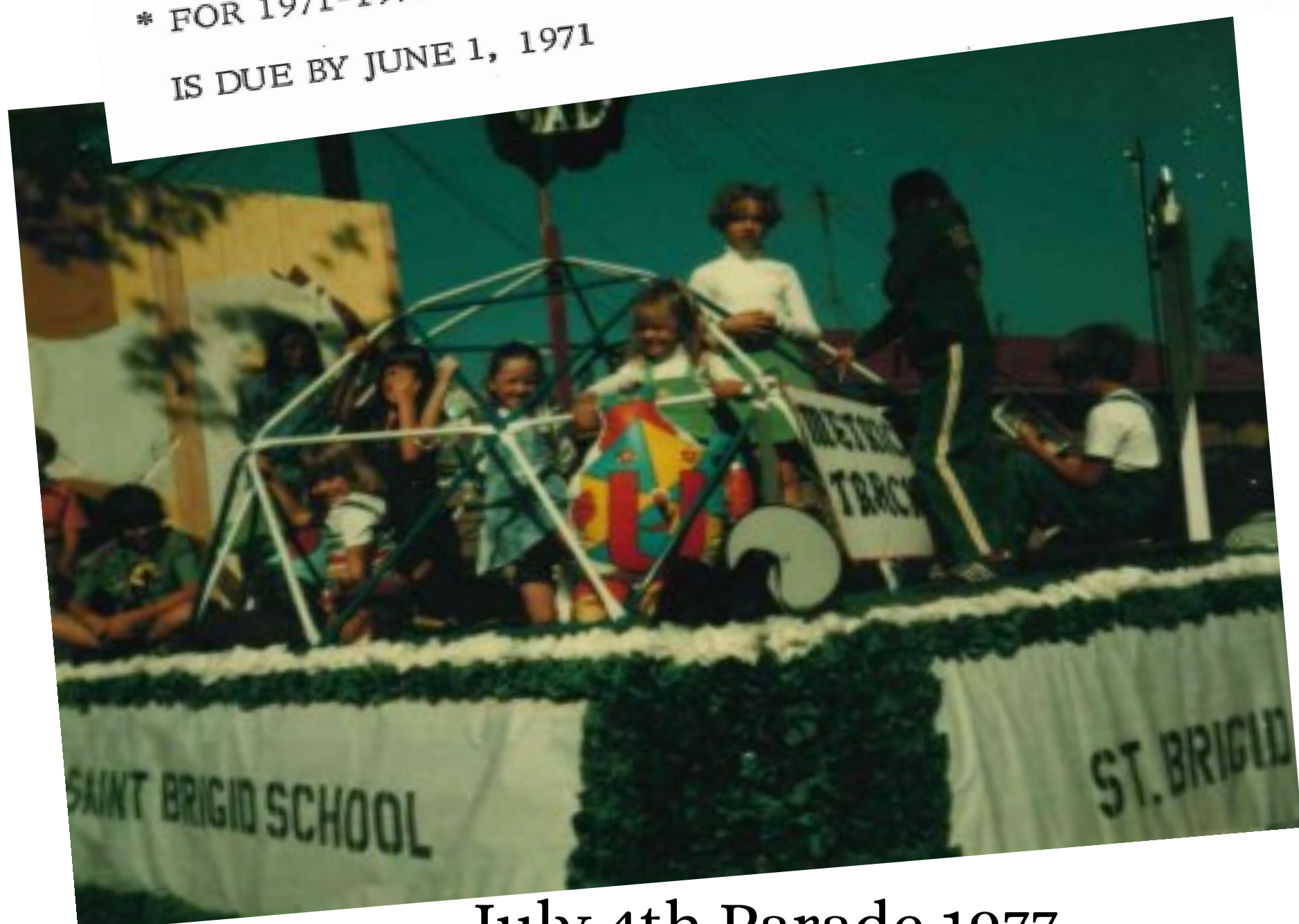
July 4th Parade 1977

Families have remained very involved in the daily school activities helping with field trips, computer aids, library aids and other needs that arise.