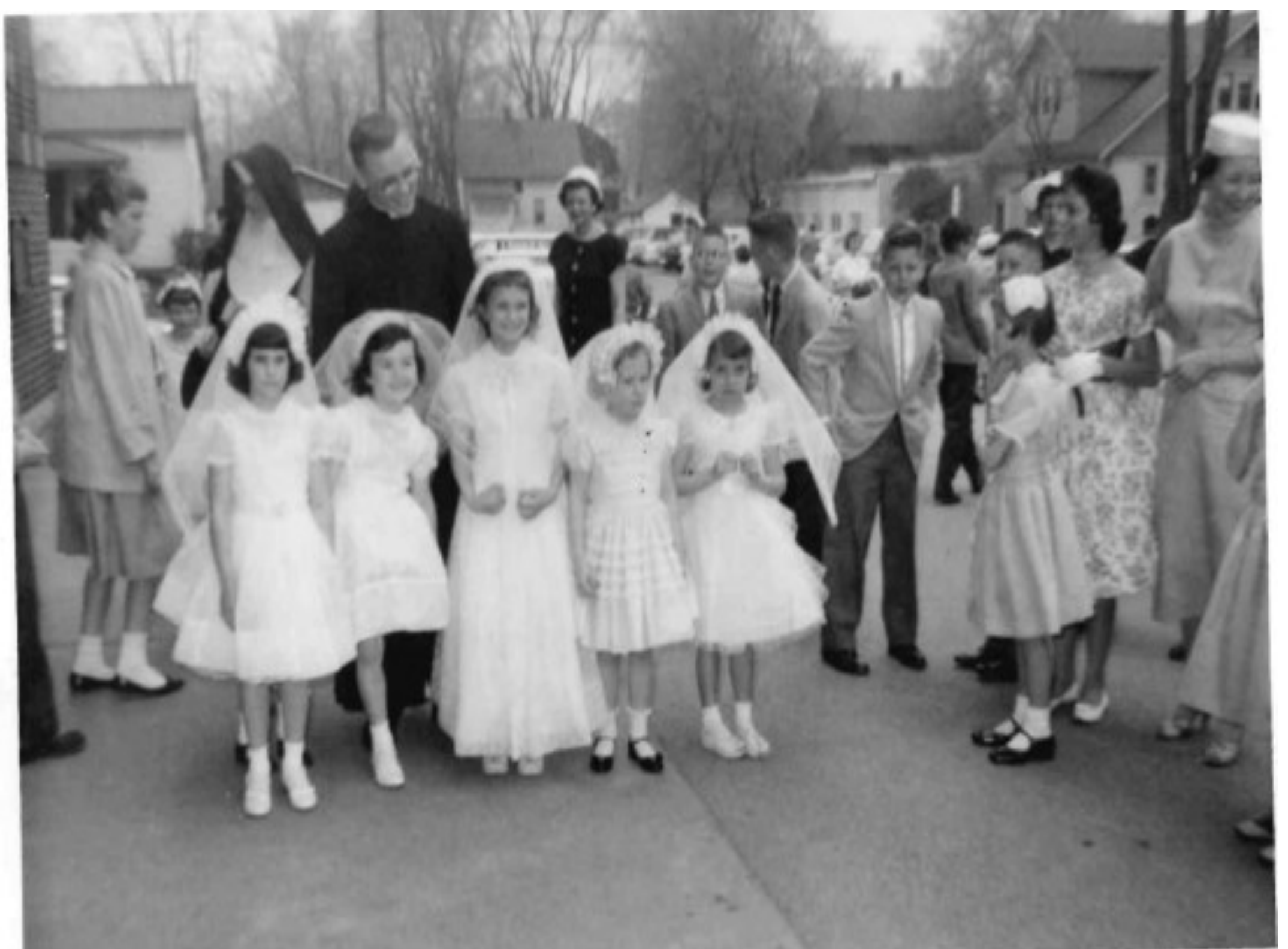
May Crowning & First Communion